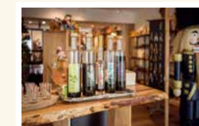
Krummußbaum | donau.com/nusseum

The private nutcracker collection consists of over 3000 collector's items from all over the world and offers delicious nut products and nut liqueurs.