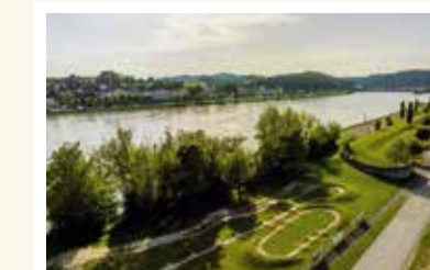
Persenbeug | donau.com/bikearena-persenbeug-gottsdorf

Let's go round – right on the Danube Shore! The Bike Arena on the Danube Cycle Path is a meeting point for local bike enthusiasts and offers a refreshing change on a Danube bike tour.