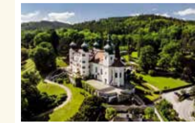
Artstetten | schloss-artstetten.at

Amidst the natural castle park lies the fairy-tale castle, inhabited by the descendants of the heir to the throne, featuring a memorial to the visionary Archduke.