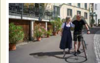
Marbach

Here, warm inn culture (the head chef) and regional cycling expertise (the innkeeper) meet directly on the Danube.