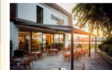
Ybbs | donau-lodge.at

At this place of peace and relaxation, you can enjoy the water experience directly on the banks or on the hotel's own boat as well as the culinary experience in the restaurant.