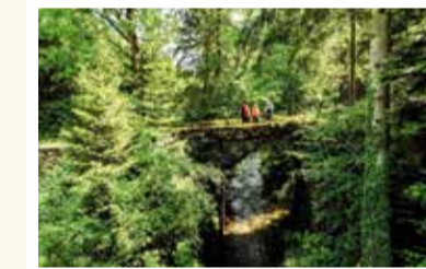
Artstetten | donau.com/schwarzautal

Experience peace and pure nature on this path through interesting landscapes, with three historic bridges and diverse flora and fauna.