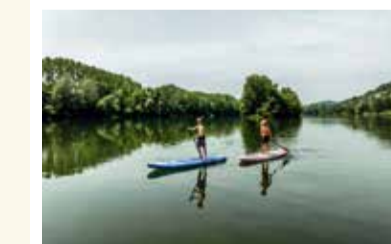
Weitenegg | donau.com/leiben

This bathing paradise, located directly on the Danube Cycle Path at the foot of the Weitenegg ruins with views of Melk Abbey, is ideal for an active day by the water.