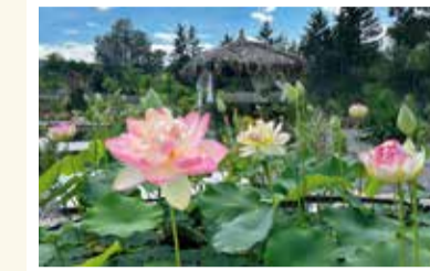
Onding | gaerten-oberleitner.at

Experience the fascinating plant world in the Garden of Diversity with exotic lotus flowers. Show garden with a feel-good atmosphere and extraordinary rarity nursery.