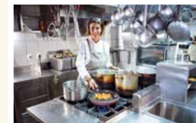
Erlauf | langererlauf.at

Discover and enjoy regional variety – from bread and potato salad to roast pork. Everything is freshly prepared with a special focus on seasonal specialties.