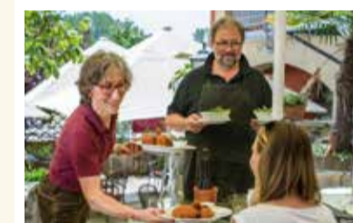
Weitenegg

Directly on the Danube Lake, beneath the ruins of Weitenegg, you will find traditional Waldviertel cuisine and living history – also to eat. Tip: Fried chicken (Backhendl) and Nibelungen cake!