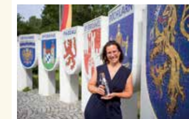
Pöchlarn | donau.com/poechlarn

Explore the sites of the heroic epic. Discover the Monument to the Nibelungs and the relaxation oasis with a foot bath, also used as a power spot with a calisthenics facility.