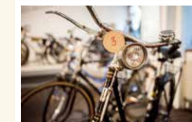
Ybbs | fahrradmuseum.ybbs.at

Take an extraordinary journey through historic vaults with unusual bicycle exhibits and an original workshop from around 1920.