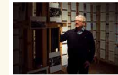
Erlauf

Discover what was sealed in the historic rooms during a secret meeting between Russian and American generals on May 8, 1945, marking Germany's surrender.