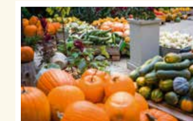
Onding | kuerbis-heisler.at

In this agricultural show farm you can marvel at over 130 varieties of pumpkins and enjoy award-winning specialties.