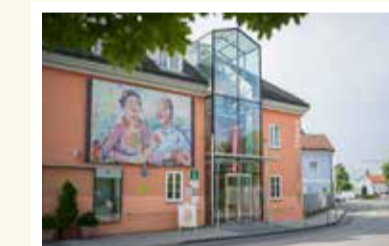
Pöchlarn | oskarkokoschka.at

The modern gallery in the birthplace of the century artist Oskar Kokoschka (1886 - 1980) documents his cultural heritage and his connection to Pöchlarn.