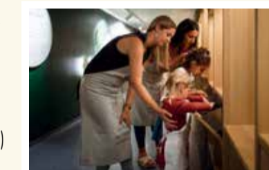
Pelzenkirchen | haubiversum.at

The bakery doors are wide open here! Take a look behind the scenes and get up close and personal with the baker's craft.