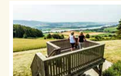
Leiben | donau.com/leiben

A special panoramic view over the Danube Valley, showcasing the highlights of the Nibelungengau (Basilica, Artstetten Castle, and more) extending to the Alpine foothills - the perfect panorama experience.