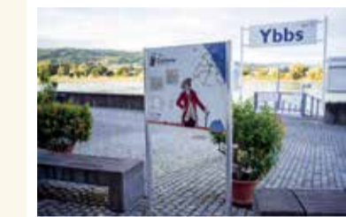
Ybbs | zeitreise.ybbs.at

A fascinating walk through the town full of historical treasures along picturesque alleyways and the idyllic banks of the Danube.