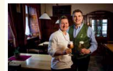
Maria Taferl

In this authentic inn with a 100-year history, “beer culture” plays the leading role, directed by the region's only beer sommelier.