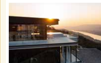
Maria Taferl | hotel-schachner.at

From the Wachauf Spa, the Sky Lounge and the restaurant, you enjoy a unique view of up to 300 km. This is only surpassed by the culinary experiences.