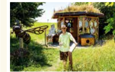
Klein-Pöchlarn

Located directly on the Danube, between the Danube Cycle Path and the motoric skills playground, you will find the stylish Bee Bar and the adjoining Bee Experience Park with a live beehive.