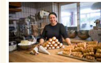
Marbach | cafe-braun.at

Besides the legendary cream and foam rolls, the homemade beach chair breakfast on the private Danube jetty with swimming facilities is a real hit.