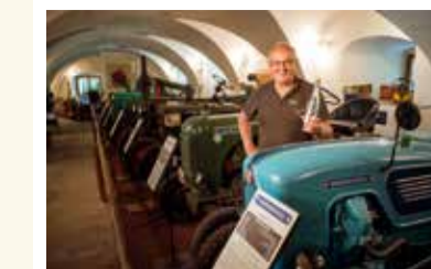
Leiben | donau.com/leiben

In the stylish ambiance of the castle, discover models of agricultural equipment and working tractors from 1910 – 1941, along with an exhibition of over 1000 scales.