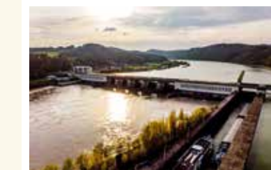
Ybbs | besucherkraftwerk.at

SHOW Power Plant with wow-effect!! Discover and be amazed at Austria's oldest Danube power plant. Get a behind-the-scenes look at power generation or take a tour of the locks (Tours only in German).