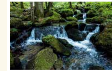
Marbach/Maria Taferl | donau.com/steinbachklamm

The impressive circular hiking trail with water features, panoramic views, and a summit book is rewarding and ideal for families.