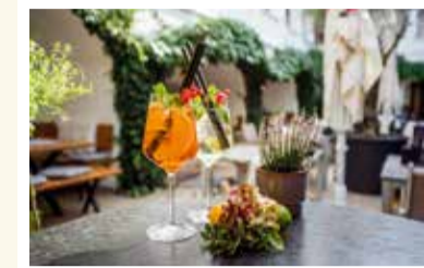
Ybbs | maximahl.at

In the 600-year-old arcade courtyard of the restaurant, you can enjoy classic, hearty inn cuisine in a particularly romantic, cool, and cozy setting.