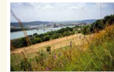
Klein-Pöchlarn | donau.com/rindfleischberg

Unique biodiversity in the wilderness of a former vineyard, where old vines and grape varieties such as the Heunisch are revitalised and cared for.