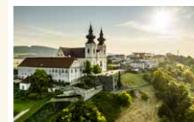
Maria Taferl

The pilgrimage church on the Camino de Santiago is an architectural jewel of the region, rewarding visitors with impressive views of the Nibelungengau and a magnificent altar.